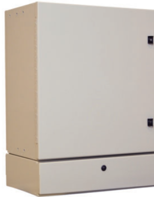
OHC-432 Representative of 288, 432 and 576 single door front & back form factors, pad or pole mount

OHC are constructed from powder-coated aluminum that is both durable and lightweight. Units can be quickly installed by a single technician. Front and rear access doors are secured with low-profile, 216-tool quarter turn locks and padlock hasps for additional access control. A grounding bus bar with multiple grounding studs is provided.