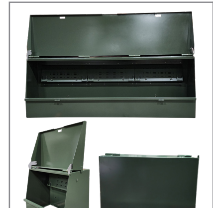
Power Sectionalizer Cabinets