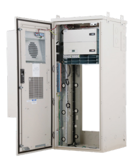
Pad Mount Cabinets (PM Series)