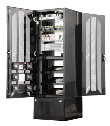
Indoor Cabinets (ID Series)

• ID Series in 18RU, 36RU and 48RU sizes