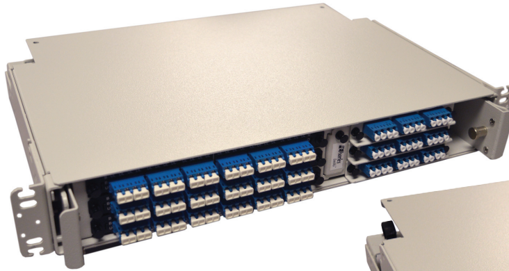
LiteVu 1.5RU Chassis

Optical monitoring increases network uptime and availability, and reduces service time when network issues arise