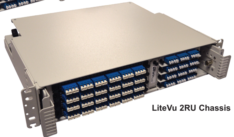
LiteVu 2RU Chassis