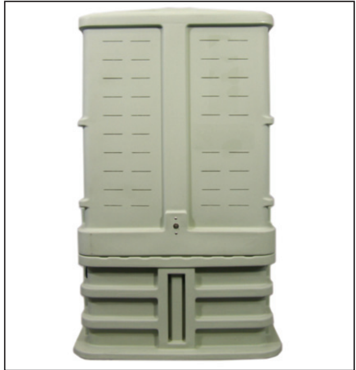
CMPH-7500 Vented Lid Option for Housing Weather-Hardened Active Electronics