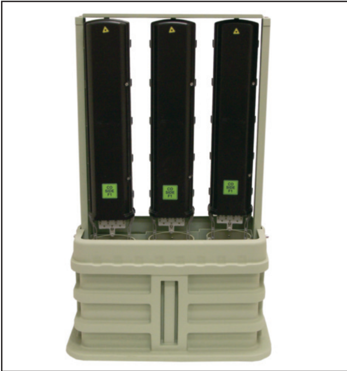
CMPH-7500 Cell-Site Configuration (Wireless Backhaul to Multiple Service Providers)