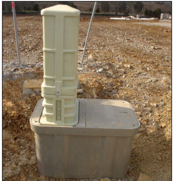
CMPH-7500 Vault-Lid Mounting (Requires Optional Hardware Mounting Kit, Copper or Fiber Cable Slack Storage)