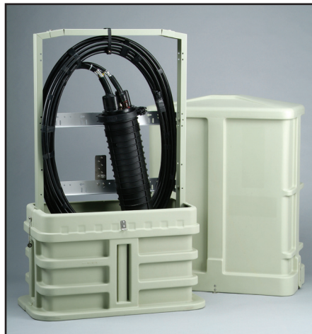
CMPH-750FN Fiber Configuration