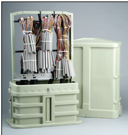
CMPH-7500N Copper Configuration

In cell site applications, the CMPH 7500 enclosure is ideal for installation either inside or outside the tower's fence line, without the need to construct a concrete pad. The enclosure can be configured with one, two or three independent two-sided fiber backboards with integrated connectorized bulkheads and fusion splice storage trays. This multi-backboard enclosure design allows the backhaul service provider to partition fiber access to multiple cellular providers from a single enclosure, with each end user having secure access to only their fiber connections.