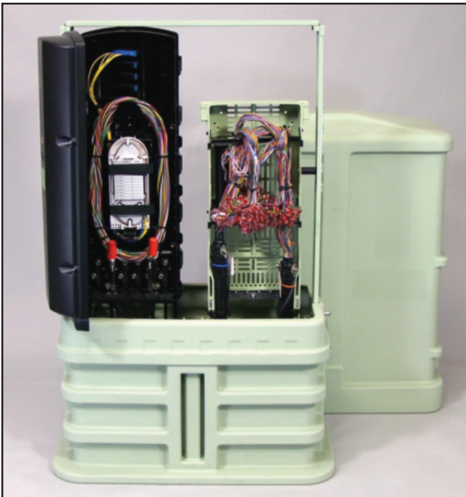
CMPH-7500 Copper / Fiber Co-Location Configuration