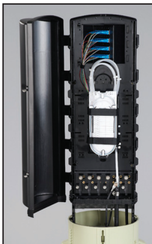
Central Office Side of 10” Fiber Organizer