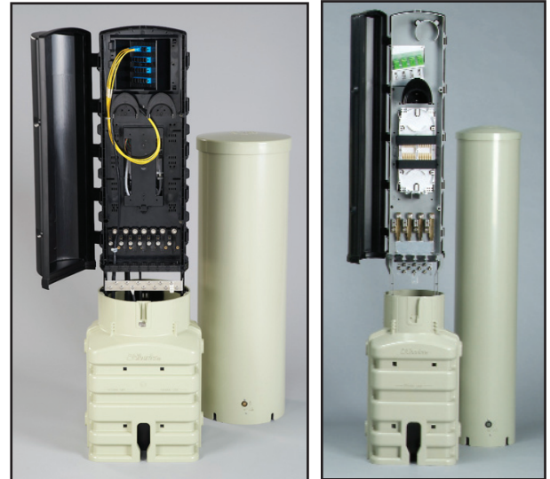
10” (left) and 6” (right) CFDP Interconnect Pedestals

CFDP Pedestals offer two-stage environmental protection of fiber distribution points. This two-stage protection is accomplished by housing a weather-tight interior enclosure within the confines of a non-metallic buried distribution pedestal. Together, this “enclosure within an enclosure” combination is designed to exceed Telcordia GR-771-CORE specifications and provide an unbeatable line of defense against the elements, including floods, fire, dirt, debris, insects, and corrosion.