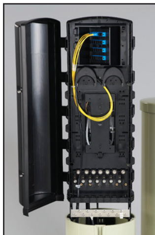
Drop Side of 10” Fiber Organizer