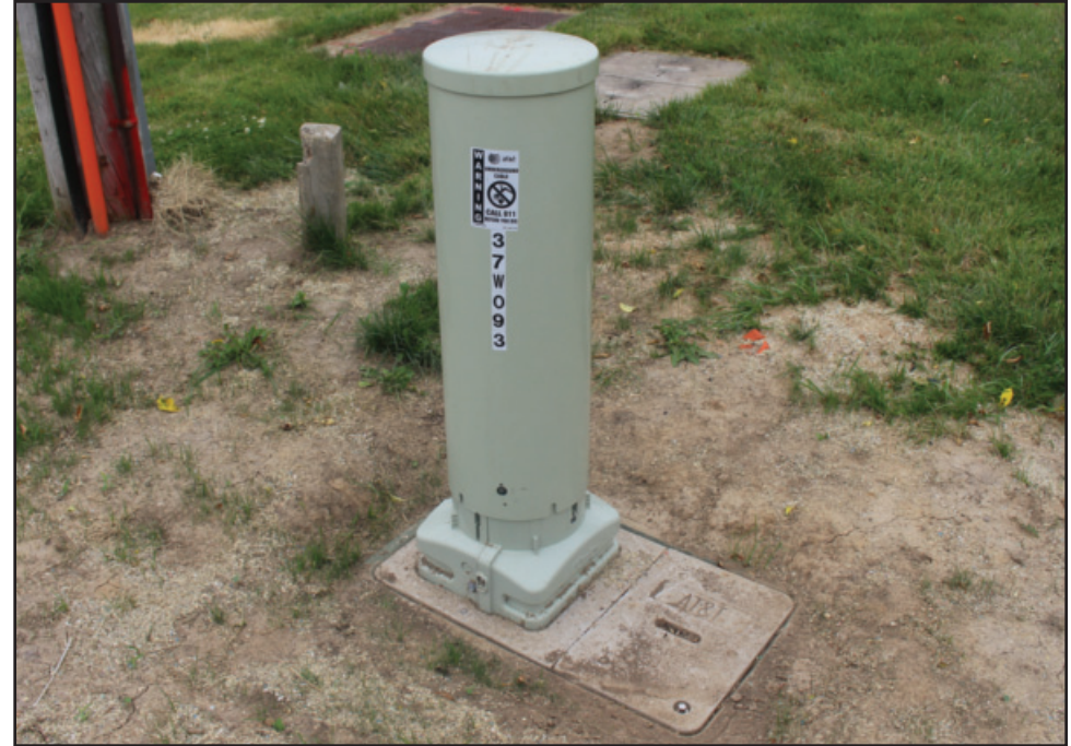
Vault Mounted Pedestal (Handhole Design May Vary)