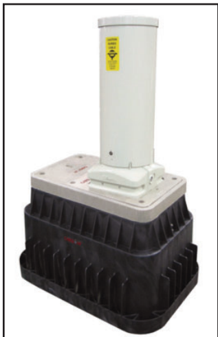
BDO ON VAULT MOUNT