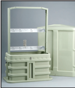
CMPH-750SFNH/ATT & CMPH-751SFNH/ATT WITH OFFSET FIBER OPTIC STORAGE BRACKETS