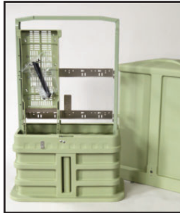
CMPH751SFNHCU/A COPPER & SEALED FIBER SPLICE CLOSURE SOLUTION