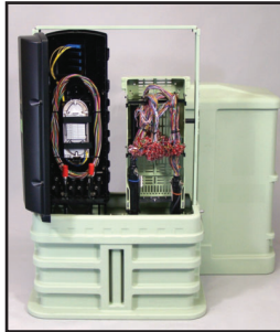
CMPH-7SN11UIB/A COPPER/FIBER ENCLOSURE FTTB & CELLSITE SOLUTION (shown with installed fiber and copper splices)