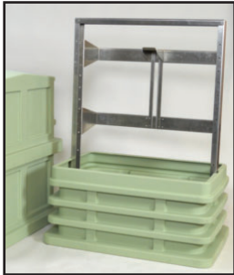
CMPH-850FN/ATT WITH OFFSET FIBER OPTIC STORAGE BRACKETS (2 SECTION DOME)