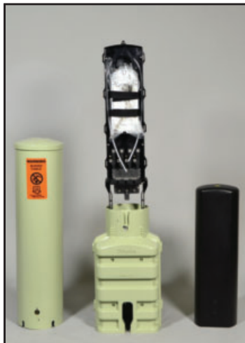
CFDP206-EPS & CFDP208-EPS WITH FIBER SPLICE COMPARTMENT