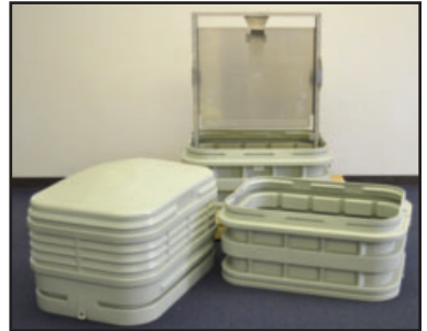
CMPH-950DFNCU/A COPPER & SEALED FIBER SPLICE CLOSURE SOLUTION (2 SECTION DOME)