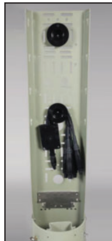
CPLM 6/ATT PEDESTAL FOR CORNING FLEX-TERM (shown with 2 accessory bend control kits [#FBRK10/ATT] and 4-Port Corning Flex Term)