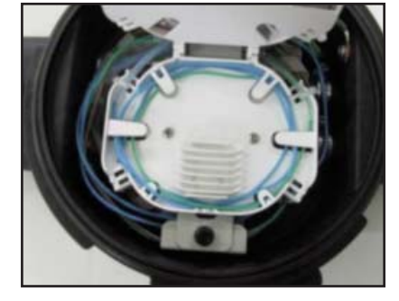
Three splice tray capacity, each 12 single fusion splice