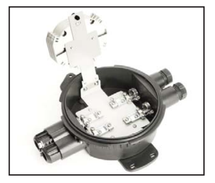
Hinged Splice Tray Bracket (service position)