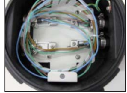
Dual feed port and two branch ports