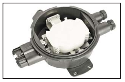
Hinged Splice Tray Bracket (storage position)