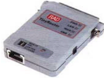
Fig. 2: RAD TinyRouter