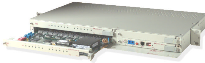
Fig. 2: 360-80 ICB

The Charles 360-80 Intelligent Channel Bank (ICB) provides a cost effective platform for managing T1 voice and data services. With its advanced design and multi-service compatibility, the 360-80 ICB maximizes T1 services while minimizing installation, maintenance and support costs.