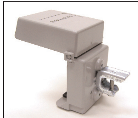
400-3518 units feature a beam clamp for attaching the terminal housing to a steel beam.