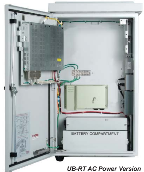
UB-RT AC Power Version (shown with optional fiber management and battery backup)