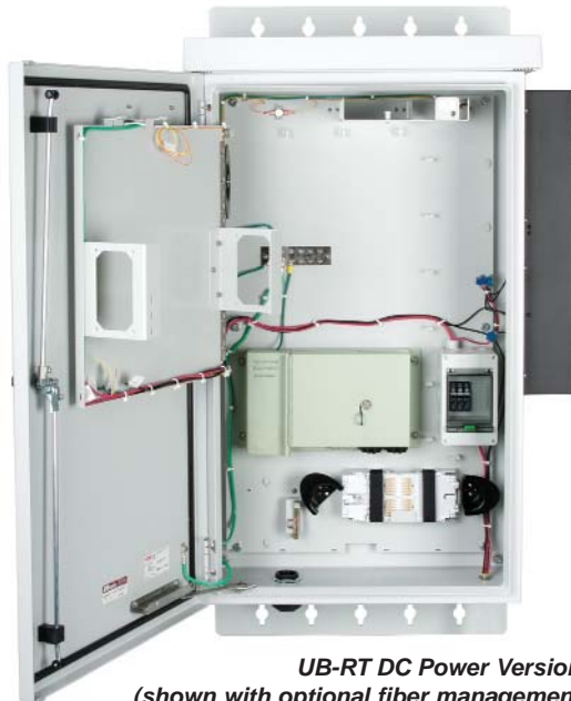
UB-RT DC Power Version (shown with optional fiber management and heat exchanger)

Designed to house a variety of manufacturers' electronic equipment, the UB-RT is pre-wired to meet your power, protection and physical interface requirements. Many customizable options give you the flexibility to meet your every backhaul application.