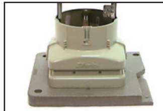
Vault Base Option

For Vault base option: Update part number, change "-" to "V" (i.e. CFXC12EV12B1)