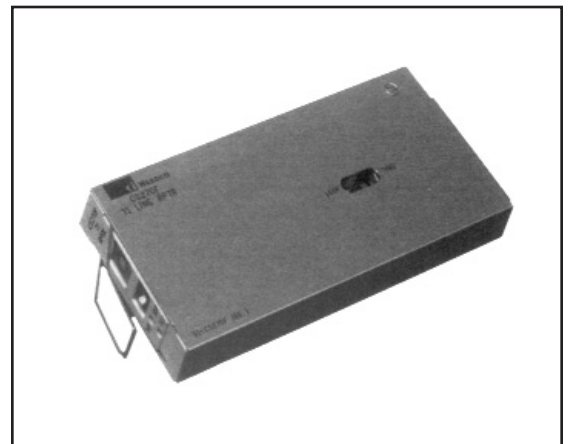
T1 Span Line Repeater